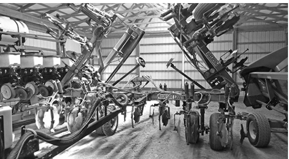
Progressive 1300 strip-tiller, 12R w/markers, John Blue ground driven high cap. pump, Red Ball monitoring system, 3-whl. tow behind 750-gal. nurse tank, all in good cond., field ready, $26,000. (616) 366-1640