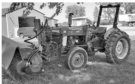
Ford broom tractor, model 3910, new rear tires, $4,500. (989) 620-4226