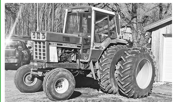
IH 1586, brand new duals, 3-rem., $15,500. (989) 826-3160

3500 6R Amity sugar beet topper, like new AGI Westfield 8"x71' grain auger 3500 High performance generator New Craftsman 10-amp reciprocating saw New Craftsman 3/8"x53' air hose & reel Hypertherm Powermax 45 plasma cutter Artsway 692 sugar beet harvester w/all Richmond updates, field ready Westfield 8"x60' ground auger for grain (810) 705-0181