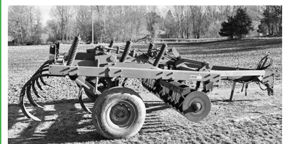
'95 Case IH 6500 chisel plow, 9-shank, HD reset, hyd. disc gangs, very clean & slightly used plow, $6,500 or best offer. (517) 554-8818

'14 Great Plains turbo chisel, 11-shank w/ rear chopper whls., $17,000 Westfield transport auger, 8"x56', PTO drive, $2,500 (269) 760-6567