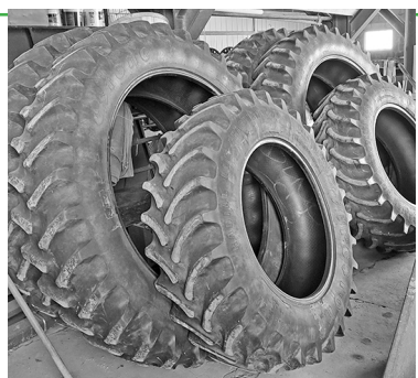
Firestone tires (2) 14.9R30, $500; (4) 14.9R46, $1,500. Refurbished JD 4455 & put new on Call after 3:30 pm (989) 239-3963

30' Rotary hoe JD 400 8R Brillion folding cult. JD 40 combine (574) 633-4852