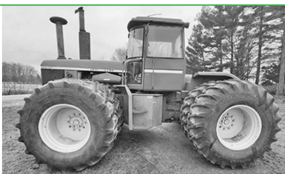
'78 JD 8630, 1000 hrs. on 50 Series reman. motor, 24.5x32 tires, new hyd. pump, system has been flushed, $20,000 or best offer. (269) 275-0887

(4) Firestone 225/70R19.5 tires, 14-ply, $100 for all JD 7000 6R, good cond., $3,250 JD 930 flex head, field ready, $4,000 or best offer (989) 763-1084