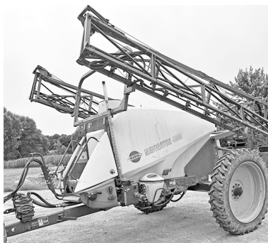
'11 Hardi Navigator 4000 sprayer, 1200-gal. liquid tank 130-gal. rinse tank, diaphragm pump, new diaphragms & valves in Spring '23, 90' Eagle boom, no cracks, triple nozzle bodies, tank & tires not age checked, $18,000. (586) 615-9761