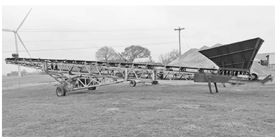
Conveyor sand stacker, 80', direct feed bin, new belt, new head & tail whls., used for stacking dairy sand, used 5-yr. ldr. to feed. (989) 620-4226