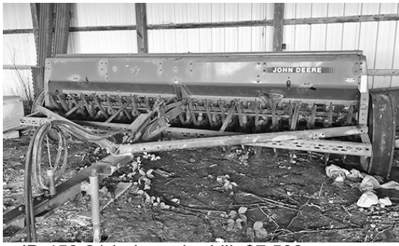
JD 450 21-hole grain drill, $7,500. (586) 405-7835

Call (517) 745-8192 for more! Shipping avail. for parts!