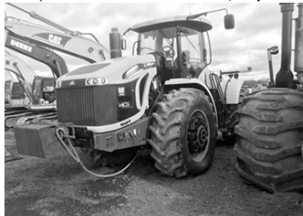
'11 Scaper Edition, Cat MT965C articulated tractor, tight center, Cat C18 550 hp, 18 spd. Powershift trans., scraper hitch & cable, (N.A.P.) ..... $159,500