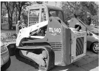
Takeuchi TL 140 tracked skid steer, 81 hp, quick coupler bucket, 60% tracks, good drive sprockets, runs & operates well, some bucket play, work ready . . . $19,500