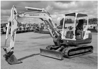
'08 Takeuchi TB250, 10,000# machine, frt. blade, swivel boom, 40 hp, good tracks, 2 spd. tracks, aux. hyd., quick attach, work ready machine . . . $27,500