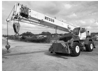
'98 Terex RT335 rough terrain crane, 4x4, (4) whl. steer, 6 spd. powershift trans., Cum., 35-ton, 30'-94' boom, 30' jib boom, (2) block sheave, aux. winch line, 23.5x25 tires @ 60%, 9500 hrs. . . . . $59,500