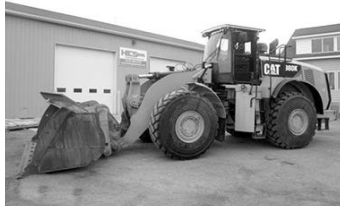
'13 Cat 980K, 7-yr. GP bucket, quick coupler, ride control, command steer, air seat, heat & A/C, 4 spd. powershift trans., tight center, orig. paint, work ready machine, 16,500 hrs. . . . . $189,500