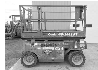
'07 Genie GS2668RT scissor lift, rough terrain, 4x4, dual fuel eng., 68" basket, 26' work platform ht., slide platform, pwr. to basket, work ready machine. . . . $13,500