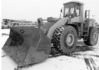
'99 Komatsu WA500-3L, EROPS, heat & A/C, Cum. eng., 29.5x25 tires @ 60%, straight clean original machine, 4 spd. powershift, ready to work, tight center, tight bucket. .... $59,500