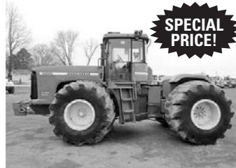
'03 JD 9400, 12.5L dsl., 450 hp, new pwr. shift trans., 41,000 lbs., ready to pull a pan, cab, A/C, heat, radio, ROPS, diff. lock, 4WD, wt. 41,879 lbs. .... $59,500