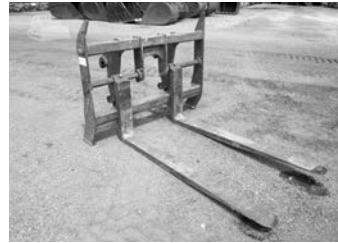
CTI forks, 416 JRB Series, 72" long by 64" wide fork carriage, 30-1/2" center-to-center of hooks, 6" wide tines x 2-1/2" tine thickness. . . . . $4,000

MORE INVENTORY - CALL WITH YOUR ATTACHMENT NEEDS OR QUESTIONS! (616) 218-9715