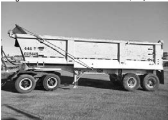
'00 MAC 25' lead tdm. axle, air ride, half round box, alum. frame, set up for lift axle, air tail gate, elec. tarp, nice trlr., work ready ..... $17,000