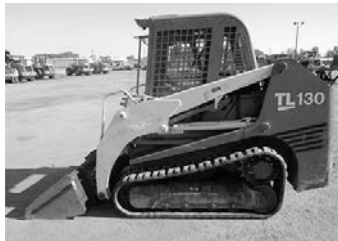
'05 Takeuchi TL130, aux. hyd., quick coupler hyd., 2 spd. tracks, 60% tracks, brand new track sprockets, 7500# operating wt., 2800 hrs. .... $22,000