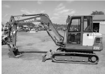
'11 Volvo EC55C mini excavator, 11,000 lbs., 53 hp w/aux. hyd., new quick coupler, ready to work ..... $36,500