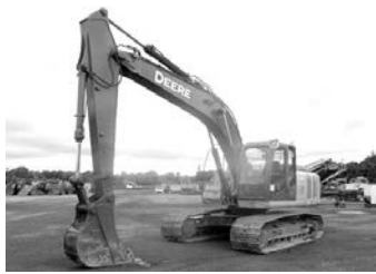
'11 Deere 200D LC, long & wide U/C @ 70%, 32" pads, aux. hyd., long stick, 42" bucket, control pattern changer, pilot controls, digital dash ... $59,500