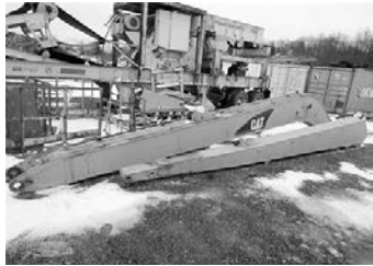
Cat 320 long reach 50' booms, boom & stick, 29' long boom, stick is 20'7" long, boom to house pin 90mm w/27" base width. . . . . $12,500