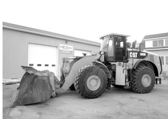
Cat 980K whl. ldr., 7-yd. GP bkt., quick coupler, ride control, command steer, air seat, heat, A/C, 4 spd. Powershift trans., tight center, 16,500 hrs. .... $199,500