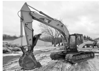
'06 Cat 325CL, cab, heat, A/C, extra quad aux. hyd., long stick, 36" pads, 90% U/C, 6200 hrs., 35" bucket w/hyd. thumb, nice clean straight machine, work ready . . . . . $72,500