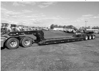
'00 Talbert 55-ton lowboy, 25' well, 102" wide, tri-axle, air ride, outriggers, detachable non-ground bearing neck, 255/70R22.5 tires @ 80%. . . . . $37,500