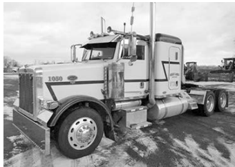
Pete 378 flat top, 48" slpr., Cat C15 Accert 600 hp, o'haul, sgl. turbo conversion, 10 spd., new clutch, A/C, cruise, Jake, covered rear axles, 12F, 40R, 11R24.5 alum. rims, 80% tires, wet kit . . . . . $49,500