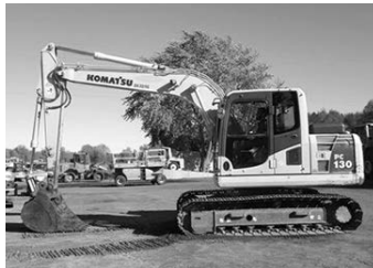
'11 Komatsu PC130 LC-8, long & wide U/C @ 70%, digital dash, aux. hyd., orig. paint, long stick, 38" bucket, work ready, 8800 hrs. . . . . $49,500