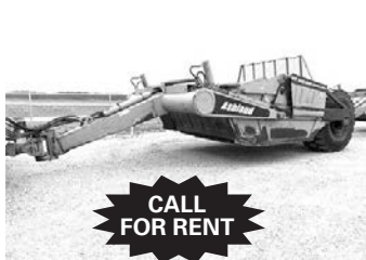
'06 Ashland I180TS, 18-yd. 10'6" cut, good cutting edges, good bearings & hubs, 29.5x25 tires @ 70%, set up for secondary pan, (4) pans avail. ... $39,500