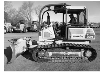
'09 Komatsu D39PX-22, OROPS, sweeps, 6-way blade, pilot controls, variable spd. trans., 70% U/C, 7100 hrs., runs & operates very well. ... $49,500