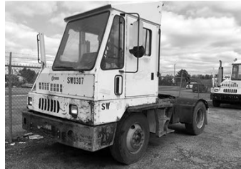
'03 Ottawa YT30, Switcher truck, yard spotter, Cum. eng., 5 spd. Allison auto., hyd. 5th whl., pilot hubs, high rise cab, susp. seat, good used truck . . . $19,500