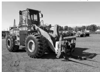
'97 Kawasaki 70Z IV, *new trans.*, EROPS, heat & A/C, Cum. dsl., 4 spd. powershift, quick coupler, 3 yr. GP bucket, 23.5x25 tires @ 65%, ready to work. . . . . $36,500