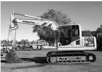
'11 Komatsu PC130 excavator, long & wide U/C @ 70%, digital dash, aux. hyd., orig. paint, long stick, 38" bucket, 8800 hrs., work ready machine. .... $59,500