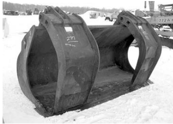
Cat 115" wide bucket w/top clamps to fit 950G/962G bucket. . . . . $5,600