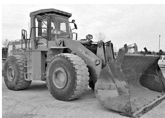
'00 Kawasaki 95Z IV, 315 hp, EROPS, 6 yd. Kawasaki 95Z IV Loadrite system . . . . . $49,500