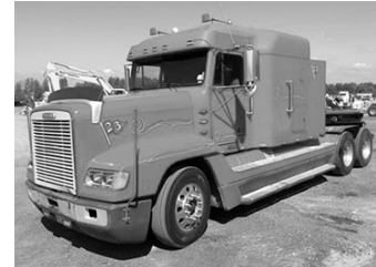
'02 FTL FLD120, slpr., 13 spd., Det. 12.7, 500 hp, recent rebuild, PTO, wet kit, setup to pull dbls., 275R22.5 tires @ 60%, cruise, A/C blows cold, 2-stage Jake, very clean straight truck ..... $26,500