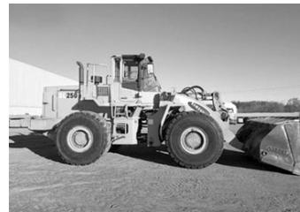
'98 Samsung SL250-2, 5.5-yd. GP bucket, 1/2 arrow edge, reman M11 Cum., 4 spd. powershift, good brakes, 26.5x25 tires @ 60% ..... $46,500