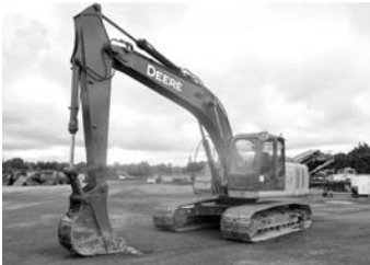
'11 Deere 200D LC, long & wide U/C @ 70%, 32" pads, aux. hyd., long stick, 42" bucket, control pattern changer, pilot controls, digital dash . . . $56,500