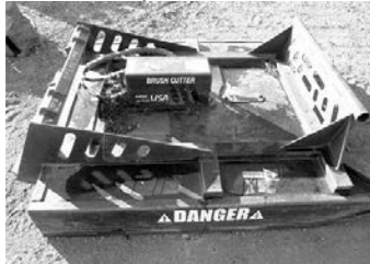
Wildcat 66" brush hog for skid steer brush mulcher/shredder, like new ..... $4,950