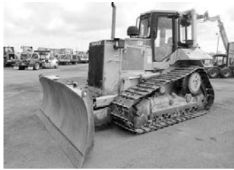
'02 Cat D6M XL, cab, heat, A/C, 6-way blade, 3 spd. powershift, 90% U/C, good sprockets, draw bar, plumbed for ripper, 13,500 hrs. .... $49,500