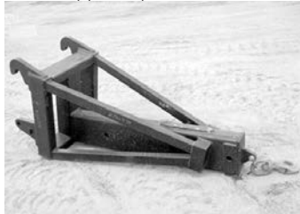
Cat 5' boom IT18/IT28 booms, 22-1/4 center to center of hooks & 21" from inside of hook to btm. lock hole. .... $1,900