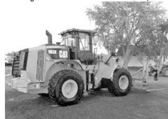
'14 Cat 962K whl. ldr., pipe grapple, 23.5x25 tires @ 70%, aux. hyd., ride control, heat & A/C, loaded up, lights, back-up camera, 8100 hrs. ... $159,500