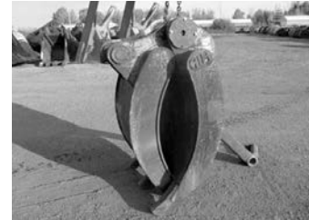
AIM excavator grapple 3x2 grapple, GP, CB linkage 42" widex62" tall, 90mm pin holes, 14" between ears on top pin & 13" between btm. .... $5,500

MORE INVENTORY - CALL WITH YOUR ATTACHMENT NEEDS OR QUESTIONS! (616) 218-9715