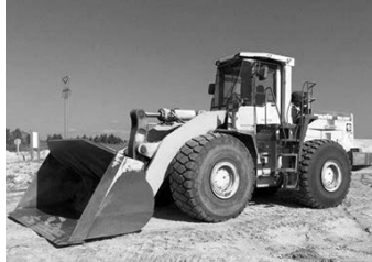
'05 Komatsu WA500-3LK, tight center, 7-yr. bucket tight, 29.5x25 tires @ 80%, radial tires, Komatsu eng., 4 spd. pwr. shift trans., runs strong, 2 stick controls, bkt. tilt/boom kickouts, call for more details. . . . . $79,500