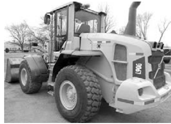
'12 Volvo L90G, EROPS, heat & A/C, Q/C, joystick controls, aux. hyd., tight center & bucket, 20.5R25 tires @ 60%, good straight machine ..... $79,500