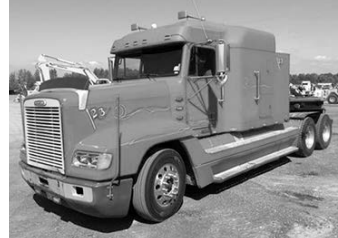
'02 FTL FLD120, slpr., 13 spd., Det. 12.7, 500 hp, recent rebuild, PTO, wet kit, setup to pull dbls., 275R22.5 tires @ 60%, cruise, A/C blows cold, 2-stage Jake, very clean straight truck . . . . . $24,500