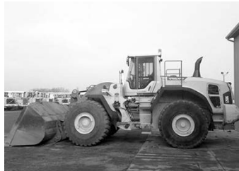
'13 Volvo L250G whl. ldr., D13 Volvo eng., 9-yr. GP bucket, pilot controls, CDC steering, 29.5x25 tires @ 80%, tight center, tight bucket, bucket kickouts. . . $179,500