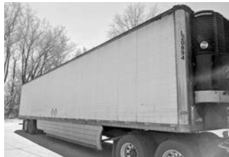
(2) 2000 Great Dane 53' reefers, flat floors, logistic posts, Carrier unit.

(100+) Storage Vans, 48' & 53', swing & roll doors, watertight!! Call for pricing. DELIVERY AVAILABLE! Call to set up an appointment.