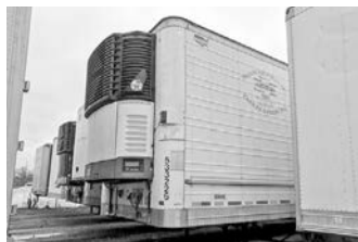
(2) 2007 Wabash 53'x102" reefers, flat floors, Carrier unit, logistic post.