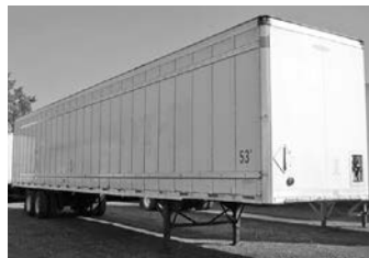
(10) Available, '06 Trailmobile & Strick 53'x102" dry vans.