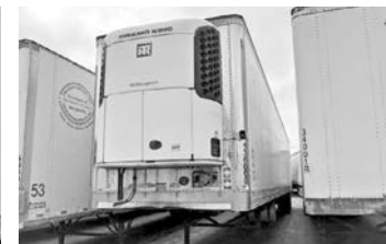
2007 Hyundai reefer, 53'x102", flat floor, Thermo King unit.