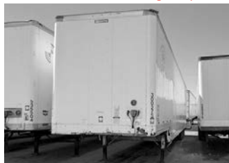
(7) 2005 Stoughton 53'x102" drop frame vans, swing doors, air ride.