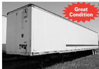
2004 Stoughton, 53'x102", plywood lined, translucent roof, air ride, swing doors.