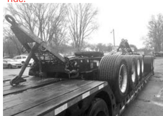
(6) 2006 Tractor dollies, (Great Danes).