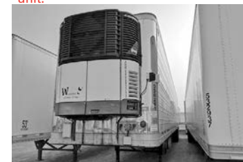
2007 Wabash 53'x102" reefer, duct floor, Carrier unit, E-track.

WE ARE BUYING TRAILERS EVERY DAY, NO MATTER THE AGE OR CONDITION! CALL TERRI PATTERSON TODAY (616) 723-1944!!