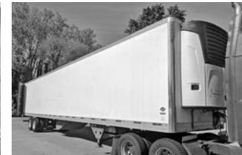
(2) 2015 Utility reefers, 53'x102", Carrier units, duct floors.