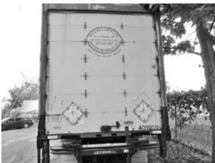
2007 Hyundai 40' liftgate van.