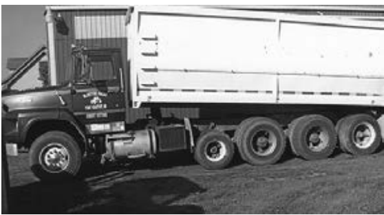
'87 Ford L8000, 270 hp dsl., 20' grain box, w/new plastic, 4-axle, tarp, $20,000. (810) 385-5323 Home (810) 434-4666 Cell

JD 7700 combine w/6R corn head & 16' grain head, $6,500 or best offer Hagie 440 sprayer, 45' booms, $2,500 or best offer (517) 445-2240