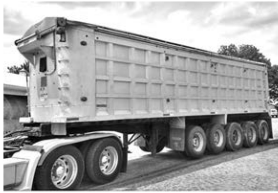
Frue. 36' 5-axle dump trlr., farmer-owned, never driven winters, stored indoors, $30,000 or best offer. (517) 881-2286