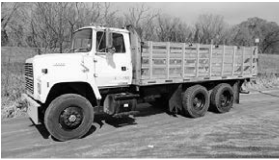
'92 Ford LNT9000, 3176 Cat, Allison auto., Hend. susp., 18' frame, will sell w/o flatbed, $12,500. (616) 836-5691