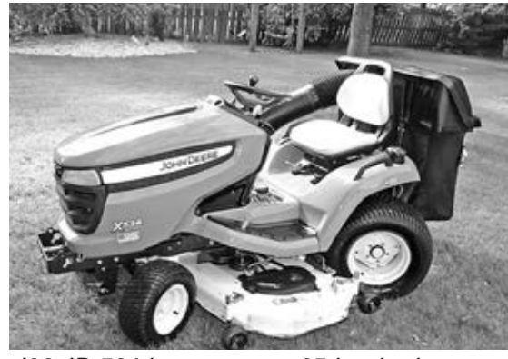
'06 JD 534 lawn tractor, 25 hp, hydrostatic trans., 4-whl. steer, hyd. lift, PS, pwr. grass catcher, 54" deck, only 246 hrs., great cond. (989) 684-9161 or (989) 684-0087 after 5 pm