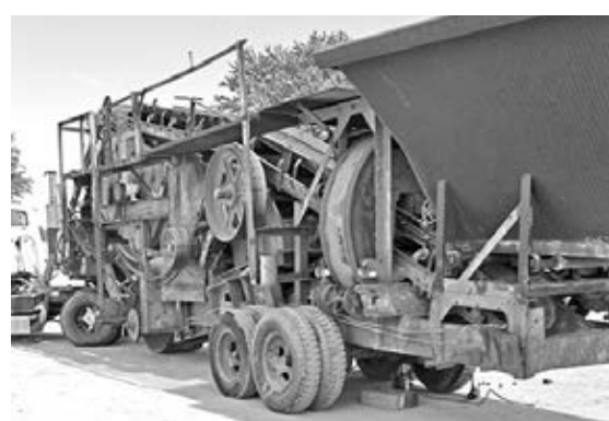
Commander crusher, 10x24 jaw/roll comb., very good cond., working when removed from site, good belts, 45% jaw, needs pwr. unit, has screen deck, $25,000.