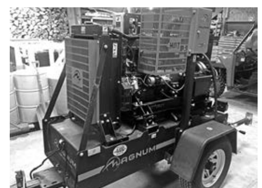
'10 Magnum MTP6000DK w/54 hrs., Kubota eng., Pioneer self-priming pump, 100' of suction & 50' of discharge hose, 110-gal. fuel tank w/trlr., $24,999. (517) 204-4747

ENGINES FOR SALE IHC 9 liter eng., $1,250 + exchange Detroit 671, $1,250 + exchange Cum. 855, 230 hp, $1,250 + exchange IHC 444E, $1,800 + exchange Cum. L10 electronic, $1,800 + exchange IHC DT360, $1,500 + exchange IHC 7.3, $950 + exchange Ford-GMC-IHC-gas engs. 8.2 Det., $1,250 + exchange IHC 7.3 Powerstroke, $1,800 + exchange V-8 & V-6 Det. L-10 Cum $1,500 + exchange 318-8V71 Detroit TANDEM TRUCK REAR ENDS Single axle 1 & 2 spd. rears, air & hyd. brakes (231) 587-9423