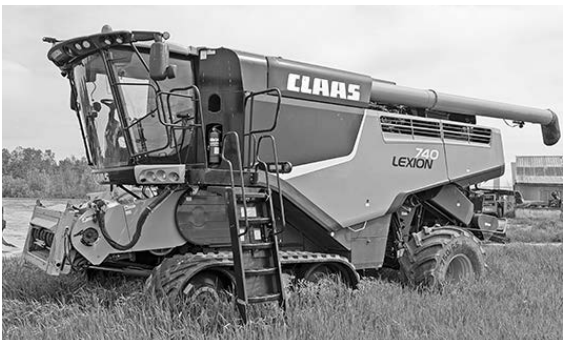
'17 Claas Lexion combine, 2549E/1605S hrs., has many new parts, 1080 draper head & 8R corn head, $180,000. (989) 737-6032

Big Tex 5th whl. 22GN tdm. dually, 25'+5' trlr. Westfield PTO drive auger, 8"x51' FFC preparator Ford 246 offset disc IH 720 518 toggle trip in-furrow plow (989) 551-0088