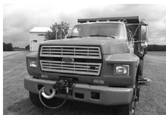
'94 Ford 800, single axle, good tires, 803 Cum. eng., auto. trans., set-up for hyd. salt spreader on rear, & set up for frt. blade, underneath scraper blade, good shape, 68,800 miles, $10,500. (517) 398-5534