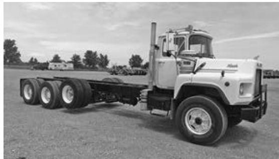
'95 Mack DM690S tri-axle C&C, Mack 300, Mack trans., 18F, 44R, dbl. frame, very clean, $16,500. (616) 836-5691