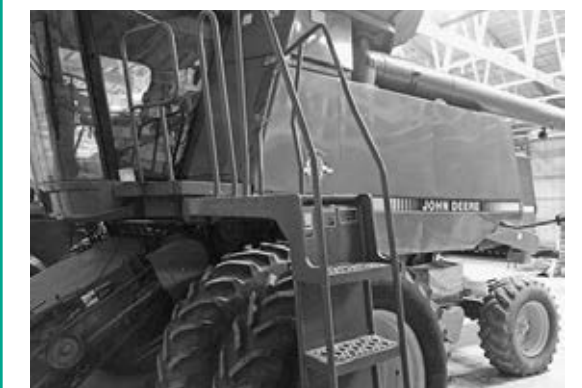
'97 JD 9500, duals 90%, well maintained, always stored inside, 3700E/2670S hrs., exc. shape, $42,000. (989) 239-4480