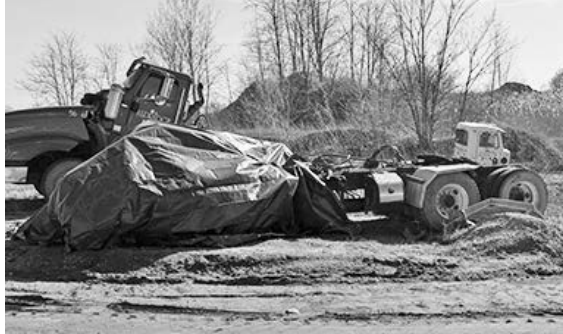
'16 Int'l., '17 Pete ISX 15 eng., cores plus spares, ran when parked, but could put new cab on Int'l. & run, or parts, take your pick, 250,000 miles, '16 $7,500; '17 $10,000. (810) 691-8542

Farm Fans 320 CF-AB S.S. grain dryer, LP gas, 220 elec., $13,000. Cell (269) 903-8481 or Home (269) 626-8293