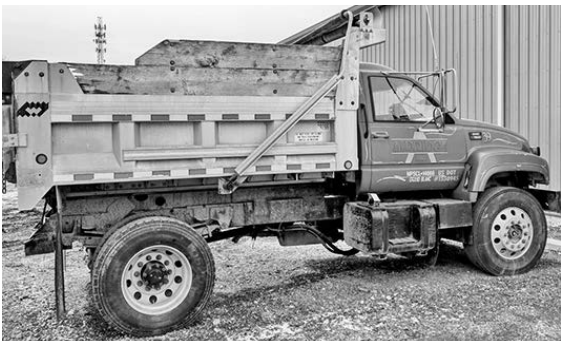
'99 GMC 7500, new 7.4L eng., alum. box, 2 spd. axle, 300 miles on new eng., $20,000. (810) 691-8542