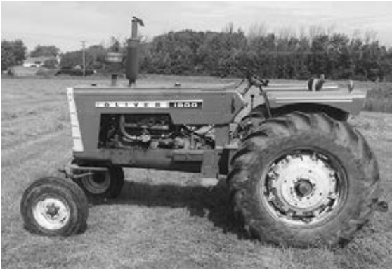
Oliver 1800G tractor, 3-pt., (2) rear hyd. outlets, PTO, exc. cond., stored inside, rblt. upper eng., tight tractor, $4,000. (989) 450-6157

9-Shank Dominator, like new JD 9400 4WD tractor, 710/70R38 tires, 5000 hrs., exc. shape, $72,000 New 5500W Briggs & Stratton generator, $575 Used 5000W Generac generator, $425 (2) 250-Gal. Demco saddle tanks, $1,500 for both (810) 705-0181