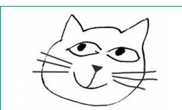
Call the Barn Cats, LLC team to build, fix, repurpose, resize, relocate or salvage your barn. We will leave your property clean and leave you happy! (616) 874-5624