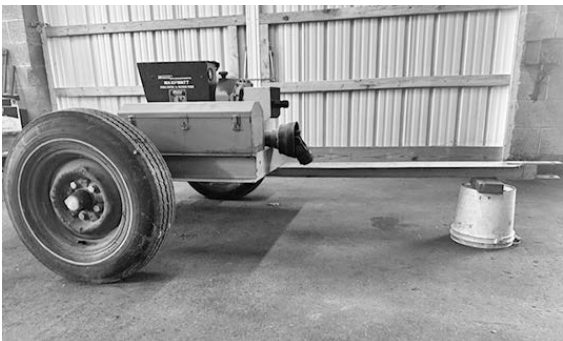
Winco 25,000W generator w/trlr., used very little. Fowler, MI (989) 640-7892