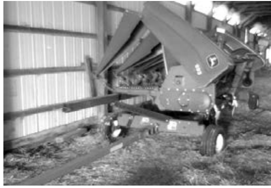
JD 693 corn head, narrow row, 30", hyd. stripper plates, like new, fully loaded, $18,900.

Rye for cover or plow down, clean, bulk only, $7 per bushel. (989) 285-0112