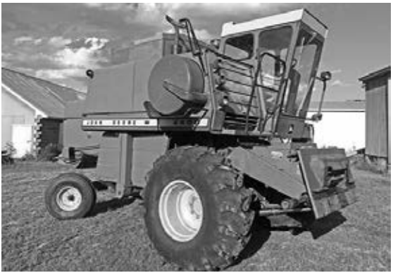
'79 JD 4400 dsl. combine & 213 head, 1715 total hrs., new feeder house, chain radiator, eng. belts, clean, straight, always stored indoors. Very nice machine, same 90-acre farm for over 30 yrs., $5,800 or best offer. (586) 823-5840