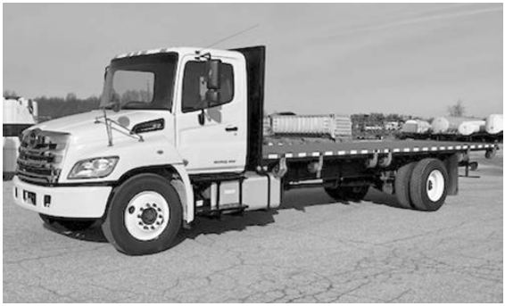
'18 Hino w/24' steel flatbed, dsl., 230 hp, auto., cruise, Jake, tilt, A/C, 200,000 miles, 25,900 GVW, under CDL, exc. cond., $33,900. (616) 836-7255

Badger 6' snowblower, 3-pt. hitch, single stage, $1,750. (989) 831-4155