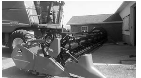
'10 JD 630 flex head, fully loaded, good shape, $18,900. (517) 206-7377

Ford 6600, dsl., cab, $6,900 Case 995, w/ldr., $4,900 Ford 300, gas, $3,900 Case 430, gas, $3,900 80" 3-Pt. rototiller, new, $2,150 8' Dozer & snow blade, heavy duty, $1,250 Ford 4500 backhoe, needs eng. work, $2,500 Several universal Q-tach buckets, pallet forks, bale spears & grapple buckets. (231) 878-0495