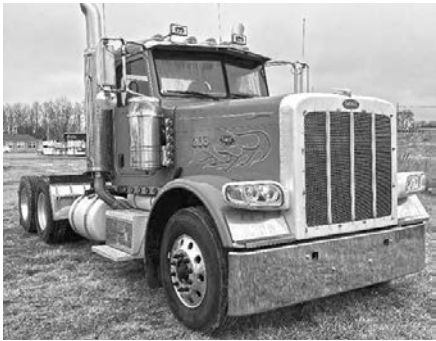
'11 Pete 388, Cat C13, 470 hp, 10 spd., Jake, cruise, tilt, alum. whls., dual exhaust & S.S. breathers, 526,000 miles, beautiful strong running truck! $41,900. (616) 836-7255