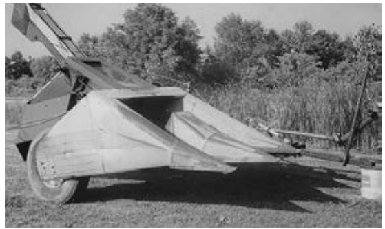
NI 2R corn picker w/(12) roll husking bed, always housed, very good cond. Also have a NI 2R w/(8) roll husking bed, nice picker, always housed. (989) 428-4367

Forage wagons, Gehl 940 & Meyers 518WF, both on 12-ton tdm. gear, both w/(4) beaters, exc. cond., always shaded; NH 890 chopper w/2R head, field ready, elec. control. (989) 277-5265