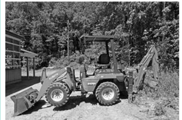
'07 Kubota R420S whl. ldr., 4x4, 1750 hrs., 9' snow blade backhoe, 40 hrs., bkt. 0.5-yds., wts., $33,000. (989) 666-5788