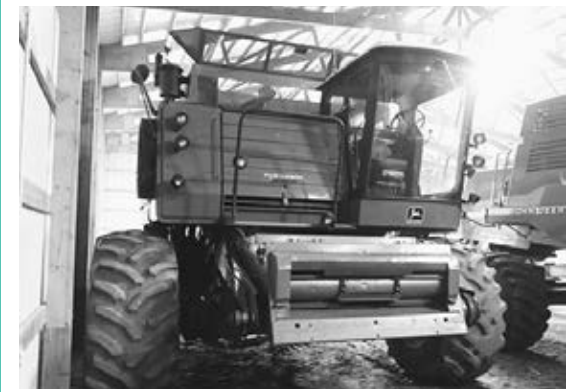
8820 4x4 Combine, 5960 hrs. field ready, yield mon., mapping, Dial-A-Matic chaff spreader, long auger, rear hitch, includes round hole bean sieve, $16,000. (810) 710-1781