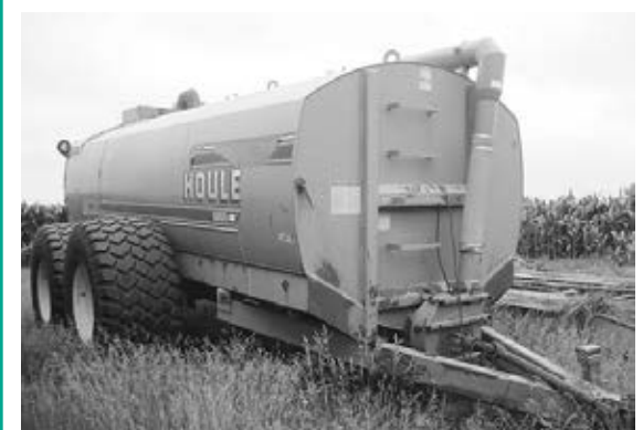
'02 Houle 6000-gal., wide U/C, (3) likenew tires, $22,500. (989) 550-0899