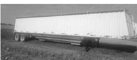
'97 Jetco 42' hopper, roll tarp, brakes 70%, tires 50%, 11x24.5 tires, new landing gear, $7,500 or best offer. (989) 565-0106 or (989) 762-5287

'72 Cat D8H dozer w/frost ripper, S/N 46A35082, $35,500. Livonia, MI (734) 525-2800