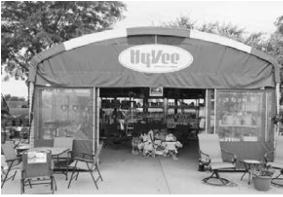
(6) Greenhouse kits, galv. H.D., commercial grade, 20 feet wide x 20 feet long x 8 feet tall, self supporting trusses, sldg. doors all (4) sides, $2,500 ea. delivered. (231) 846-0346