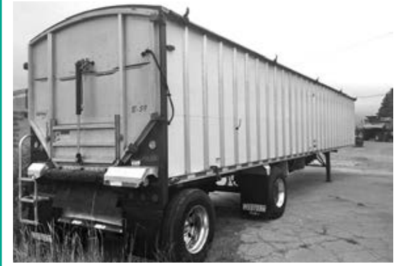
'13 Western Belt 102"x44', 77 cu. yd., tires & brakes 90%, good cond., $49,000 or best offer. (989) 205-7240