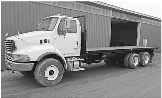
'06 Sterling tdm. axle flatbed, MBE, 450 hp, 8LL, 20F, 46R, full lockers, dbl. frame, Tuff Trac susp., 309,000 miles, will sell w/o bed, $39,500. (616) 836-5691

WANTED NH ldrs. for compact tractors model #7308, also model #15LA w/ or w/o bucket. (616) 218-3155