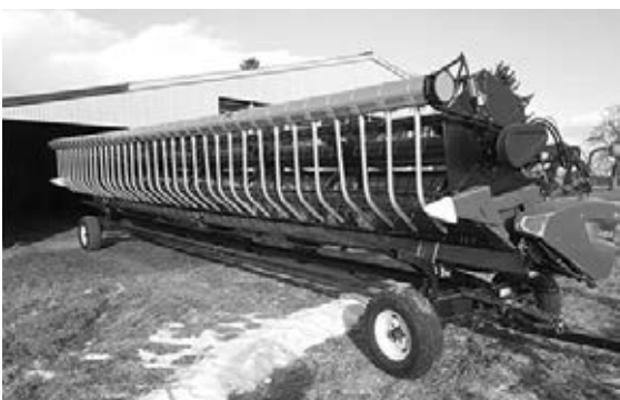
'11 Case IH 2020 grain head, 35', low acres, extra knife w/12 AWS air reel, field ready, nice cond., '11 4-whl. steer header cart included, $18,000 or best offer. (989) 763-3196