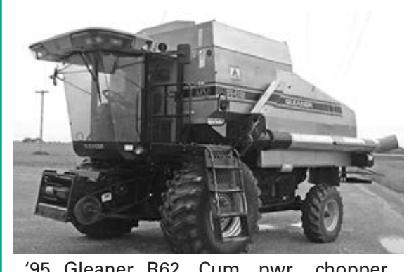
'95 Gleaner R62, Cum. pwr., chopper, 2370S hrs., well maintained, choice of 25' or 30' header. (989) 239-7823