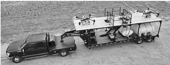
Spraying & spreading w/no compaction. Over a decade of application experience. FAA & MDARD licensed & insured. No job too big or too small. Visit www.RummerFarms.com (989) 285-2156