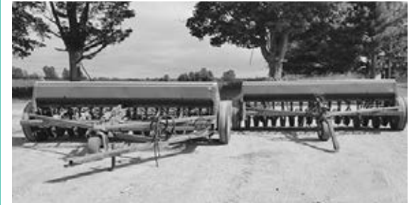
Twin JD 8300 drills, rear press whls., 10" spacing, nice cond., $5,000 for the pair. (989) 831-4444

Allis 190XT Allis 175 NH BC 5060 baler, w/thrower (3) Throw wagons Hardee TR500 sprayer, 42' Oliver 5-btm. plow, spg. reset Allis field cult., 11' JD 12' cultipacker Kewanee 14' disc (616) 754-6969