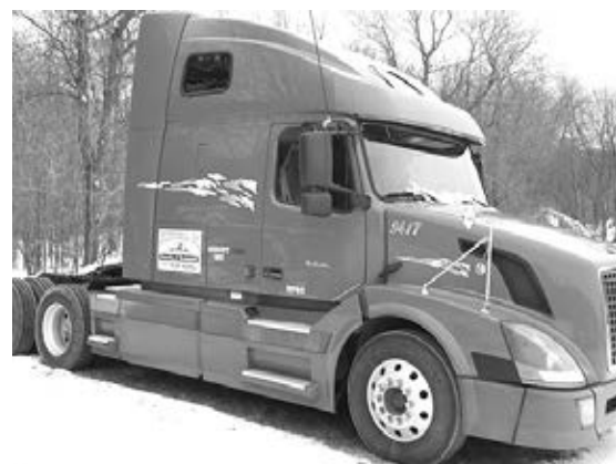
'04 Volvo VNL, 400 hp ISX Cum., 10 spd., 2-line wet kit for lowboy, 12.5F, 40R, brand new tires, newer 5th whl., alum. rims, little use last 3 yrs., $13,000, consider trade Michigan Special. (231) 539-8394 or (231) 838-3014