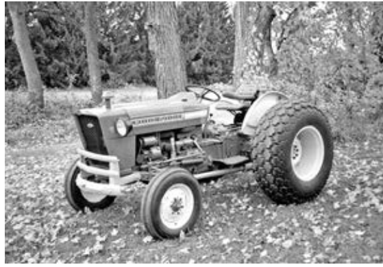
Ford 2000 dsl. tractor w/turf tires, $3,500 Kuhn GA 300GT hay rake, like new, $3,000 (269) 694-6806