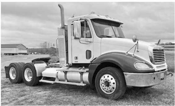
'11 FTL Columbia, Det. 455 hp, 10 spd., Jake, cruise, tilt, LOCKERS, headache rack, 700,000 miles, very good cond., runs strong w/no problems, $18,900. (616) 836-7255

Badger 6' snowblower, 3-pt. hitch, single stage, $1,750. (989) 831-4155