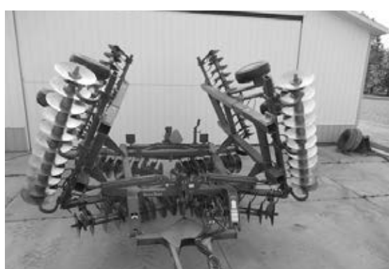
JD 637 disc, 29'3", JD rear hitch, 8-11Lx15 tires on walking beam axles, used very little, exc. field ready cond., $24,900. Cell (810) 964-4850 or (810) 655-4859

Custom no-till corn planting & no-till drilling Large square baling & round baling in the Thumb area (989) 550-0488