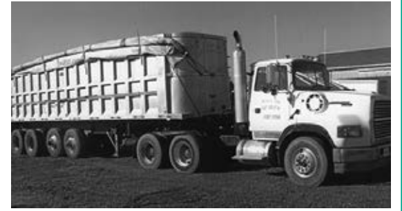
'94 Ford, Big Cum. eng., '89 Alfab 35' alum. dump, w/tarp, 4-axle., 159,787 miles, new plastic liner, $45,000. (810) 385-5323 Home (810) 434-4666 Cell

NET WRAPPED 48"x9840', $215 51"x9840', $220 Save $5/roll on a full pallet (989) 550-0488