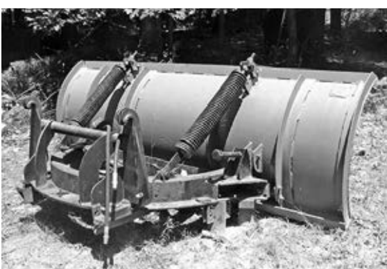
Frt. blade 3' high & 10' wide, hyd. pivot, L or R, $3,000 or make an offer. (989) 831-4155