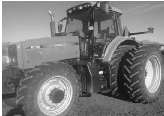
'05 Agco RT150, 848 orig. hrs., 150 hp, like new rubber, nice, clean 1-owner tractor, asking $75,000 or best offer. Washtenaw County, MI (734) 216-3399