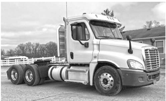
'14 FTL Cascadia 125, DD13, 475 hp, 13 spd., 3.90 ratio w/lockers, Jake, cruise, tilt, alum. whls., headache rack, exc. tires & brakes, 505,000 miles, super nice truck! $29,900. (616) 836-7255

(16) 6" Alum. pipe, 30' long, hook & latch, very heavy wall (50) 4" Alum. pipe, 30', hook & latch, (30) w/Rainbird sprinkler heads, shut-off valves & caps (989) 351-8304