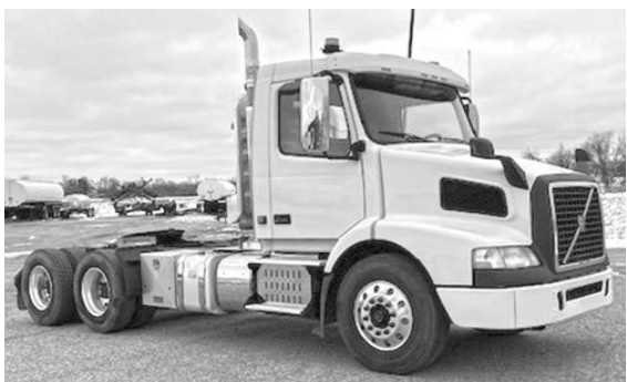
'17 Volvo VD13, 435 hp, I-shift, 12 spd. auto., Jake, cruise, tilt, alum. whls., lockers, headache rack, real nice cond., drives like a car! 525,000 Miles, $24,900. (616) 836-7255

WANTED NH ldrs. for compact tractors model #7308, also model #15LA w/ or w/o bucket. (616) 218-3155