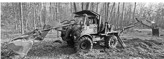
110 Hp FTL Benz Unimog backhoe, 3400 lb. ldr. cap., 17,000 lb. tow cap., 4x4, diff. locks, disc brakes, 55 MPH, 14" dig, 590 miles, 200 hrs., useful on farm, $29,995. (231) 883-2611