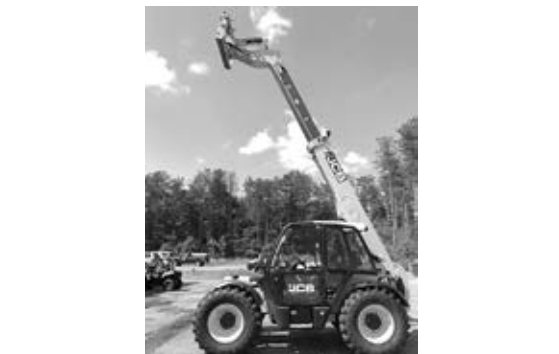
JCB 541-70 Agri+, used, great cond., new tires, heat & A/C, hyd. couplers, 9,000 lbs. lift cap., 23' max lifting ht., $77,900. (616) 581-6527