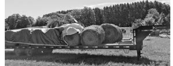
'10 Kaufman 40' 10-ton gooseneck, (3) ramps, new heavy duty tires, trlr. like new, used very little, $8,000 firm. (231) 539-8394 or (231) 838-3014