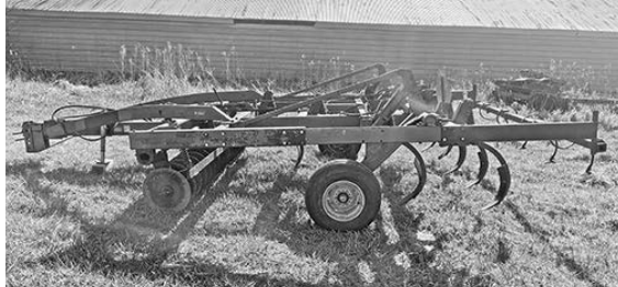
Glencoe Series 3 9-shank, 12' soil saver, frt. coulters nearly new, self-leveling, rear hitch avail., $2,700. (517) 320-0507