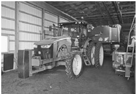
'11 JD 8235 or 5-hyd. big pump & pwr. beyond wt. bracket, quick hitch, 320/90R54 w/duals, 320R34 frts., 1824 hrs., exc. cond., $135,000 or best offer. (989) 233-9571