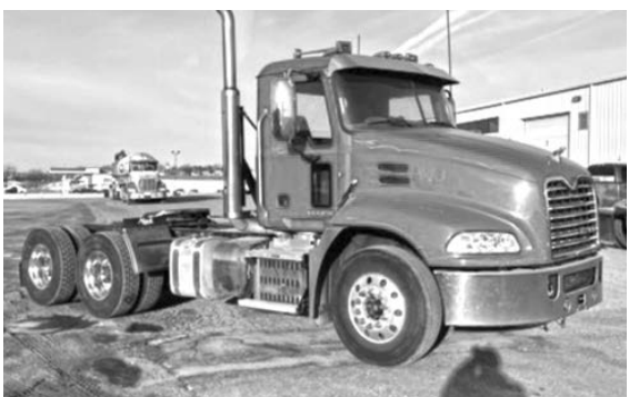
'14 Mack, Mack MP8 505 hp, 13 spd., Jake, cruise, tilt, alum. whls., lockers, 3.90 ratio, exc. tires & brakes, runs & drives beautifully, 800,000 miles, $24,900. (616) 836-7255

(16) 6" Alum. pipe, 30' long, hook & latch, very heavy wall (50) 4" Alum. pipe, 30', hook & latch, (30) w/Rainbird sprinkler heads, shut-off valves & caps (989) 351-8304