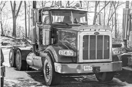
'15 Pete 367, ISX 15, 458,000 miles, ready, $45,000. (810) 691-8542

JD 997, dsl., zero turn mower, 72" cut, very nice, $5,500 JD 10' cultimulcher, $2,500 (231) 631-9167