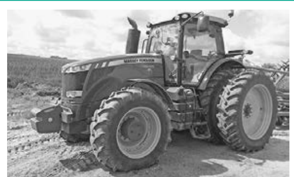
'12 MF 8650, CVT, 2250 hrs., 18.4x50 w/ duals & whl. wts., 16.9x34, frt. wts., 540/1000 PTO, very nice cond., $109,000. (989) 565-0106 or (989) 762-5287

30'-44' Flex coil packer JD 714-17 chisel 20' Flat fold packer Westco rock picker JD frt. wts. for 8000 plus JD 450 & 165 wts. 21' Woods 3240 rotary mower (574) 633-4852