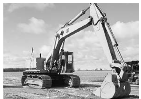
Cat 245 excavator, tight machine, very good cond., runs exc., tight pins, good U/C, mid '80's machine, $30,000 or best offer.

Custom no-till corn planting & no-till drilling Large square baling & round baling in the Thumb area (989) 550-0488