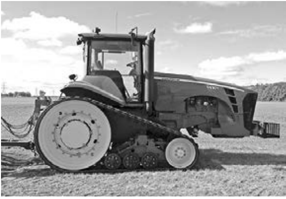
'07 JD 8430T, 4500 hrs., 25" tracks, 5-hyd. outlets w/extra returns, Power Beyond wts., quick hitch, buddy seat, PTO, recent dealer inspection, good cond., Auto. Track ready, $120,000. (989) 751-8351