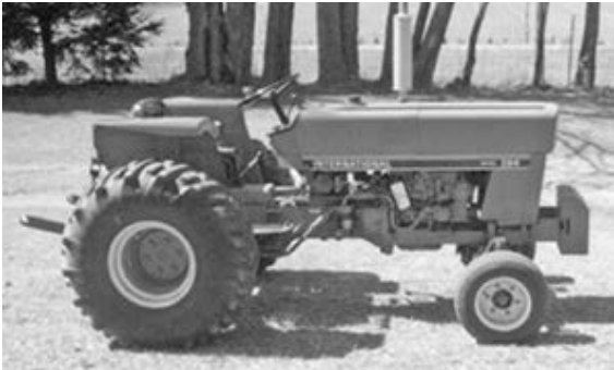
IH 284, 3-cyl. dsl., 30 hp, good cond., stored inside, $4,500. (231) 450-0607