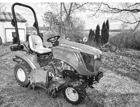
'24 JD 1023E w/AutoConnect 54D deck & 3-pt. hitch, very clean, 138 hrs., $11,000. (269) 838-5025