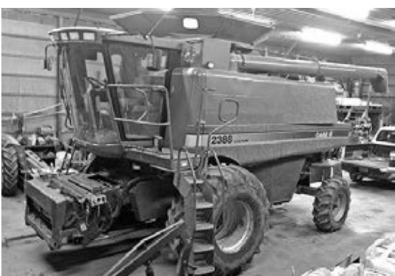
'98 Case IH 2388 combine, 30.5x32, 14.9x24, rock trap, field tracker, spec. rotor, chopper, yield mon., 2WD, 4348E/3267 rotor, 2 spd. hydro, nice cond., $42,500. (989) 565-0106 or (989) 762-5287

Semi loads of 8' hardwood, 12" logs, dry or green, picked up processed or delivered, 8' lengths, call for delivered location rate. (231) 846-0346