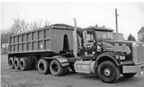
'91 FTL Mich. Special, 3406 Cat, 425 hp, Fuller 13 spd., 20F, 46R, 1-owner, 350,000 miles, '95 Frue. steel lead trlr., w/new H&H steel box, Excellent Truck, $25,000. (517) 204-1886