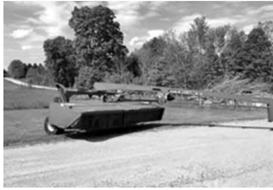
'99 Case IH DC515T, 15' hydro swg. discbine, steel rolls, field ready, $8,500. (989) 818-2008

4'x4'x4' 7/8 Plywood shipping boxes, on pallet, 3000 lb. cap., seed/feed/sawdust/shipping box for parts/machine parts storage, many uses, $60. (231) 846-0346