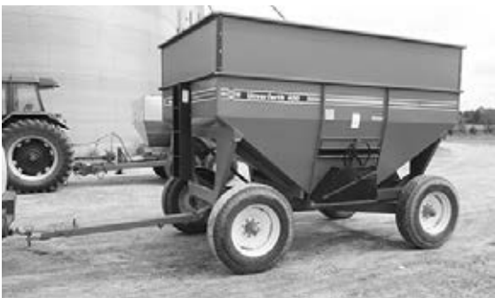
Unverferth 400, 13-ton gear, 1100x22.5 tires, like new, $5,800 or best offer. (989) 565-0106 or (989) 762-5287