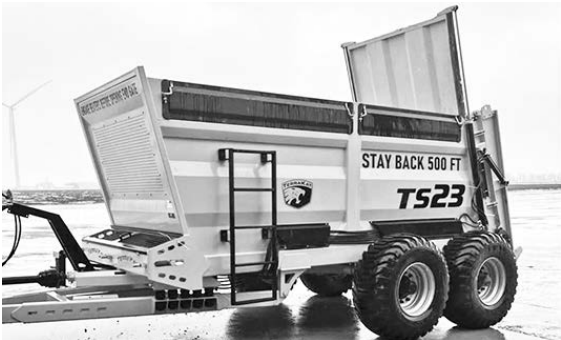
TerraKat TS23, 23-ton flail-style vertical beaters, like new cond., only used a few loads, $50,000. (989) 553-2077