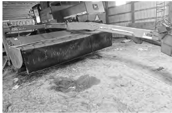
JD 635 mower conditioner, good working cond. JD 336 square baler Brady 15' stalk chopper Unverferth 6R no-till coulter attachment (231) 468-7524