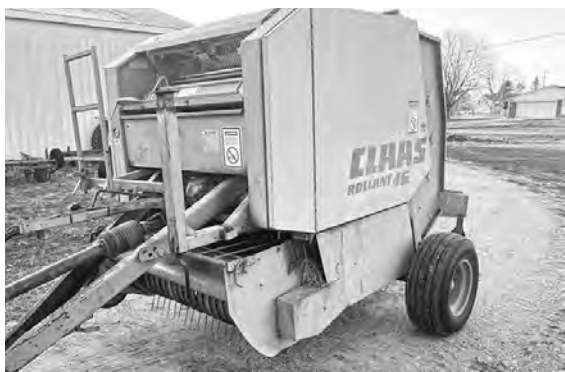
Claas Rollant 46 round baler, 4x4 bale, w/net or twine, operates good, just went to a bigger baler, $5,500. (586) 713-9488

Mail to: MICHIGAN FARM TRADER P.O. Box 25007 Lansing, Michigan 48909 or call (517) 484-7600 or FAX (517) 484-4777 e-mail: mail (at) gotoMFT (dot) com