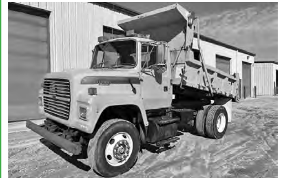
'94 Ford L8000, 8.3 Cum., 210 hp, 6 spd., M/T 295/75R22.5 10' box, elec. tarp, air gate, $12,000. (616) 677-2751

IRRIGATION PIPE 4000' Of 3", many have sprinklers 5000' Of 4" Assortment of fittings & elbows, $1/ft. (616) 894-6989