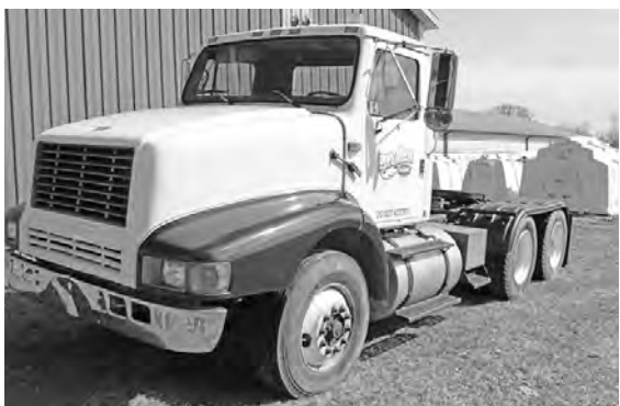
'94 Int'l. 8200, Cum. REMAN. M11, wet kit, 13 spd., all tires like new, starts, runs & drives good, $10,000. (574) 361-1495