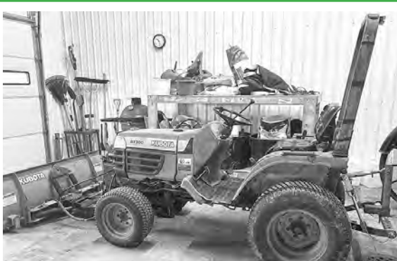
Kubota B7300 tractor, 4WD, 5' frt. blade, 3-pt. PTO, 2026 hrs., works good. (260) 350-1151