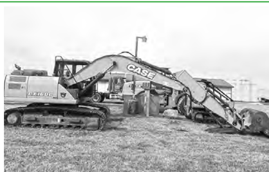
'16 Case CX160C excavator w/hyd. thumb, 2891 hrs., clean, dent-free, straight, $100,000 or best offer. (989) 539-9842