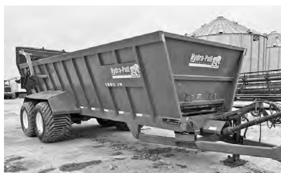
'11 Pik-Rite 1880 VB manure spreader, good cond., 1-owner, used w/beef, used 1st 6 yrs., but not since '17, shedded since, $62,500. Call or text for information or pictures (517) 719-4445

Grain-O-Vator, works great, holds (6) tons of feed, don't need it any more, $2,500. (231) 928-6067