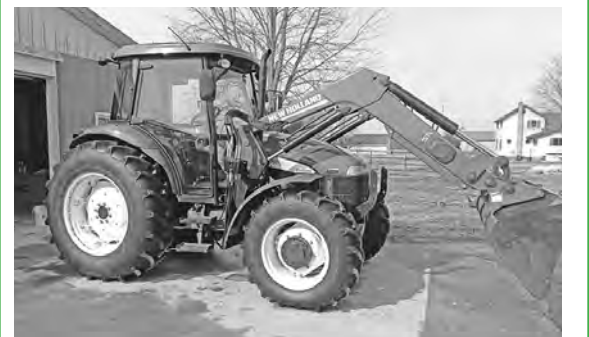
'13 NH TD5050, only 2031 hrs., always stored inside, well taken care of, reason for selling: needed bigger tractor, I've owned since 237 hrs., $49,950. (269) 207-8954