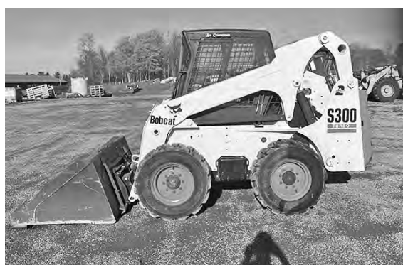
'04 Bobcat S300, A/C, 2 spd., quick tach, self-leveling, no known issues, 3139 hrs., been through shop, $24,000 or best offer. (574) 361-9847

(16) 6" Alum. pipe, 30' long, hook & latch, very heavy wall (50) 3" Alum. pipe, 30', hook & latch, (30) w/ Rainbird sprinkler heads, shut-off valves & caps (989) 351-8304