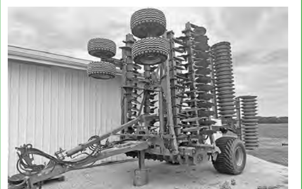
'19 Amazone Catros hi speed disc solid packer, 30' working width, 400 acres on new blades, $75,000. (989) 560-1556