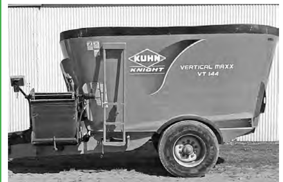
Kuhn Knight mixer, exc. cond., twin screw vertical 540 w/LH discharge, very little use, $32,000 or best offer. (989) 424-1172