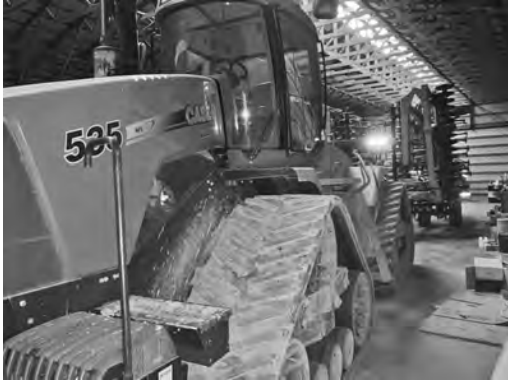
'10 Case IH 535 quad 30" tracks, 4-hyd. valves, 2500 hrs., $180,000. Dorr, MI (616) 893-8232

MF 124 baler, works, but needs work, have all parts, $1,250 20.8 8-Rail rims w/tires, $300 (517) 526-3272