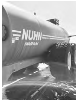
(2) Nuhn 6750 tankers, tankers hold 6750 ea., $25,000. (419) 392-2164