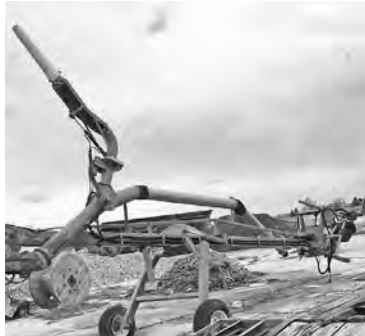
Dryhill 8" lagoon pump for sale, $10,000. (419) 392-2164