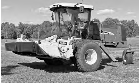
'08 NH HW345 discbine, 15' cut, 1800 hrs., in great shape, $51,500 or best offer. (810) 656-1946