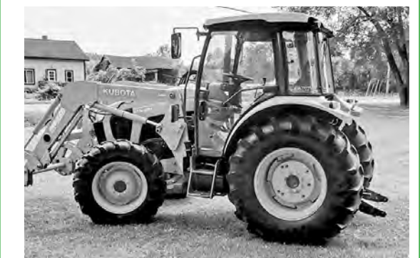
'15 Kubota M5-091, 4x4, hyd. shuttle, 725 hrs., great shape, radial tires, $53,000 or best offer. (989) 213-5872

WANTED Used or repairable spray foam marker system for field sprayer. (989) 292-0349