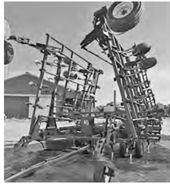
JD 2210 35.5' field cultivator, 3-bar spike, rolling basket new in '23, float hitch w/ Accudepth. Nar. transport, Nichols 7" teeth, 6" spacing, $21,000. (810) 543-5700