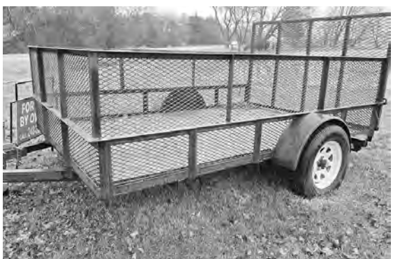
6'x10' Trailer, added sides, drop gate, new tires, $1,500. (248) 302-5554