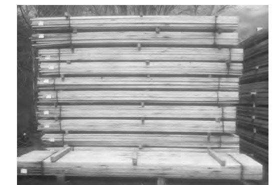
1x6x16' Oak Kentucky fence boards, (70) pieces/bundle, full bundle sale only, $10/ piece, $700/bundle. (989) 539-9842